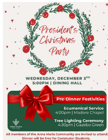
Ecumenical Service, Tree Lighting, and President's Christmas Dinner