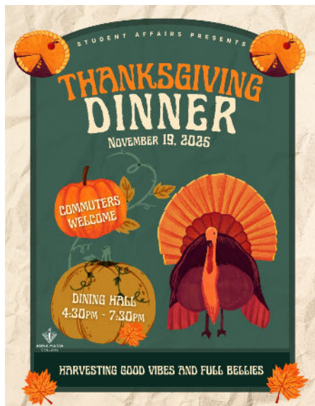
Our Annual Thanksgiving Dinner