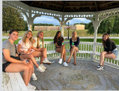
Photo: New students enjoying our iconic gazebo during Orientation!

If your student has not yet attended an Orientation session, they must attend Last Chance Orientation on Thursday, August 21.