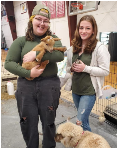
More fun with the farm animals at Fall Fest!