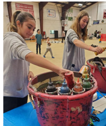
Make-your-own tie dye frisbees!