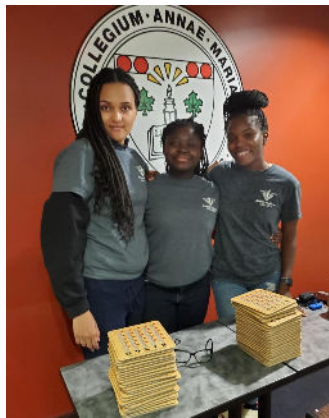
Student Programming Assistants ready for bingo!