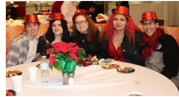
Merry and bright!