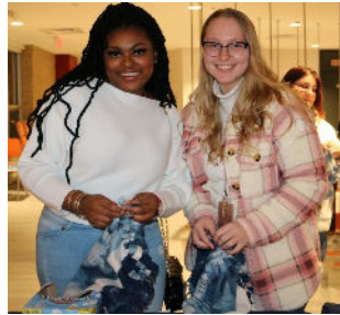
Hot cocoa and cozy crafts!