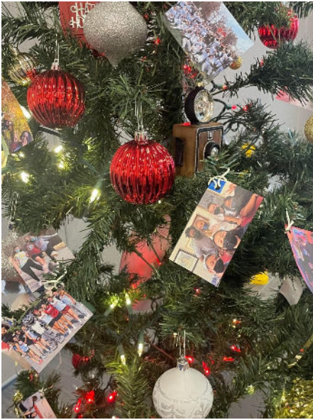
Class of 2023 - Time Flies!