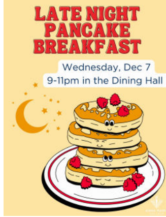
Late night study break!