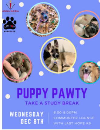
Relaxing with puppies!