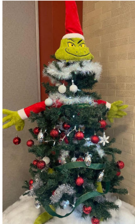
Class of 2024 - The Grinch!

Anna Maria College | 50 Sunset Lane, Paxton, MA 01612