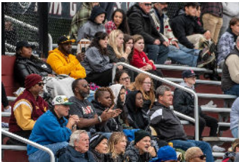
Plenty of supporters in the stands!

We started the weekend with a family dinner before the women's field hockey game on Friday. The Campus Center Takeover on Friday night featured fun food and crafts, indoor mini golf, and a movie for students and families. Saturday morning began bright and early with coffee, doughnuts, and the women's basketball 5K fun run, followed by the women's soccer game. The afternoon brought the Multipurpose/Baseball Field groundbreaking, an art exhibit at Miriam Hall, the Alumni Mass at Madore Chapel, and the Reunion Classes dinner. The Homecoming football game was well attended despite the chilly weather, and food trucks and a beer garden added to the day's festive atmosphere. The weekend was capped by the men's soccer game at Caparso Field!