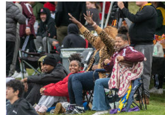
Lots of tailgating fun!