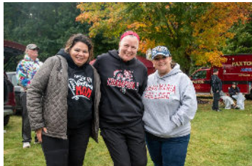
Friends and families were beaming with pride!